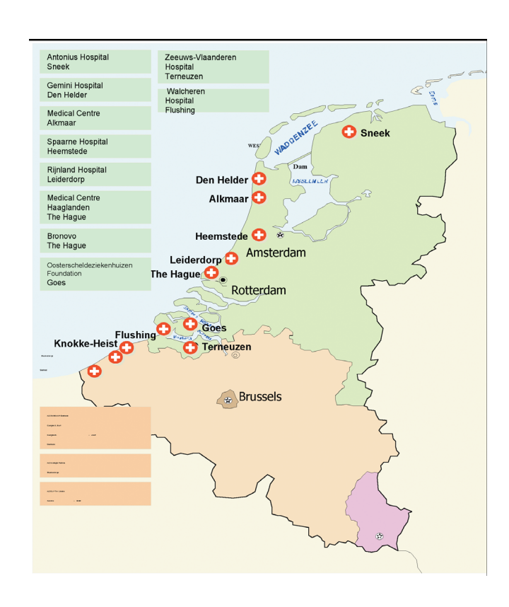
FIGURE : HOSPITALS ON THE DUTCH AND BELGIAN COASTWITH AOK CONTRACTS

www.aok-rheinland.de http://europa.aok.de www.ehealth-impact.org/case_studies/index_en.htm